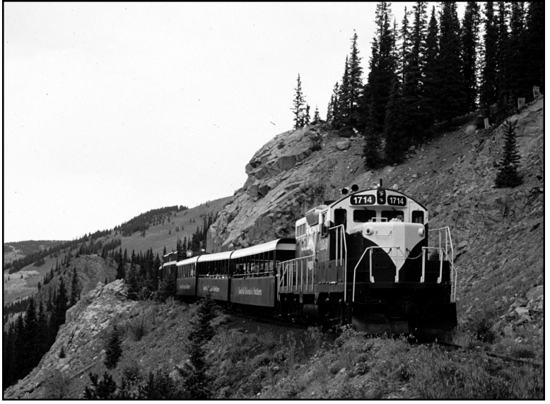
Leadville Colorado & Southern excursion train.