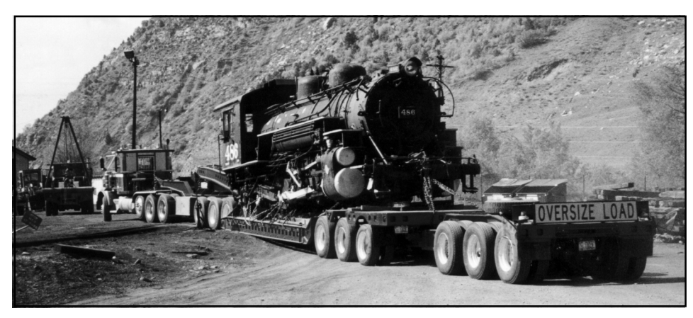
Engine 486 arrives in the D&SNG Durango yard on 5/22/99. The truck was placed over tracks, the trailer under the cab was detached and the trailer dropped to the rails. The locomotive was pulled off the ramp with another locomotive.

The 486 arrived in Durango Friday afternoon 5/21/99 after a 265 mile trip from Canyon City where it had been displayed for some 30 years. Sharp Trucking of Pueblo owned the special truck/trailer rig. Loaded GVW was over 210,000 pounds which required two highway bridges to be rebuilt to take the weight. Coming over Wolf Creek Pass a "helper" truck was lashed to the rear of the trailer to add power and braking over the pass. The down hill run was done at a careful 7 m.p.h. The D&SNG plans to rebuild the locomotive this winter at a cost of $250,000. A repainted and lettered 499 was loaded for the return trip to the Royal Gorge for display.