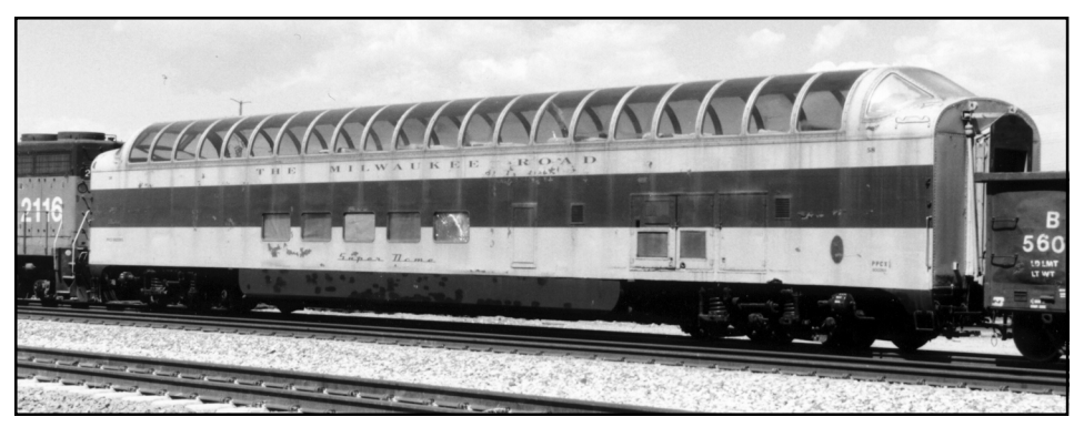
American Orient Express (AOE) owned ex-Milwaukee Road Super Dome #58 arrived in Denver on May 20, 1999, via BNSF. BNSF's Kountry Job moved it south to AOE's shop at the old General Iron Works plant on May 22, 1999. The car features seating on the upper deck and a buffet lounge downstairs.

blue with gold numbers). The other car had a few windows covered with plywood but many windows had the glass in. It had no number but at one end a large round logo with three letters visible, but the only one large enough to see was an "A." Both cars had vestibule doors open and the steps down.